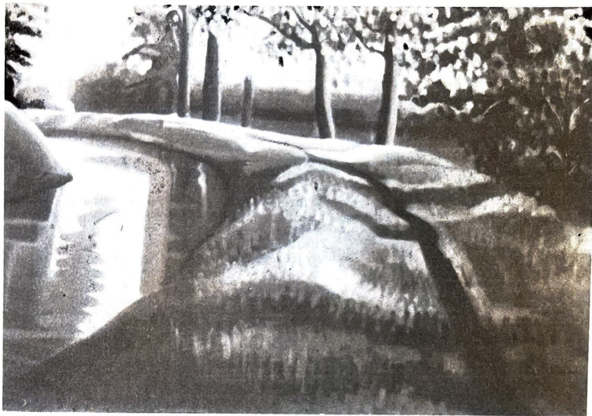
RECENT LANDSCAPES by Barbara Postel include (clockwise from above) 'River Towpath,' 'Oued Lou' and 'River - Pt. Pleasant View.'